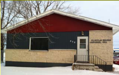
808 Burrows Road McCreary, Mb. R0J 1B0